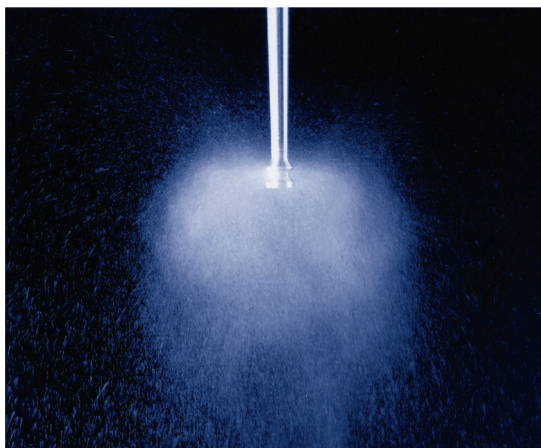
360° radial spray

The new Digisonic III ultrasonic atomization system is a robust and effective method of coating one or multiple parts from a single drive system. This system can drive up to 5 individual horns simultaneously through a single electronic module. This feature is accomplished by introducing our multi-element booster to the ultrasonic transducer. This innovative design provides all of the accuracy and effective coating characteristics of the IVEK ultrasonic atomizers while dramatically reducing equipment costs. Most of our previous horn designs are also adaptable onto the new systems. These include some of our unique and patented radial and micro-bore atomizers. Equally impressive is the improved durability and lower cost profile making it a perfect solution for specialized coating applications. IVEK uses vibrational frequencies of 40 KHz (standard).