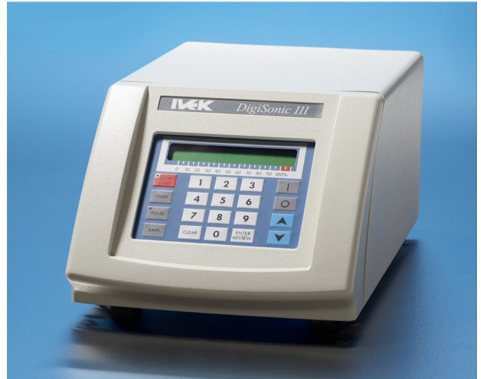
digisonic III controller module 146mm H x 203mm W x 349mm D