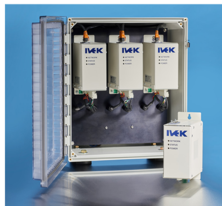
installation example for DigiSpense® 4000 panel mount

The DigiSpense® 4000 Benchtop controller has all of the dispensing features listed above but with a fully enclosed power supply and HMI for benchtop or stand-alone use. A front-panel LCD screen with pushbuttons allows full configuration of dispensing profiles and start/stop of dispensing operations. Contact-closure IO on the rear panel provides both control and status of dispensing operations using such devices as foot pedals and totalizers/counters. Optional Ethernet fieldbus communications for data acquisition or PLC integration is available.