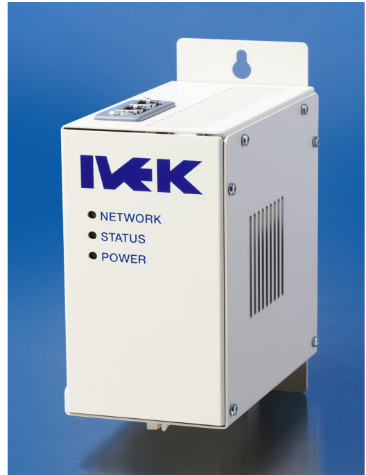
DigiSpense® 4000 panel mount controller module 7.6 cm x 19 cm x 14.3 cm