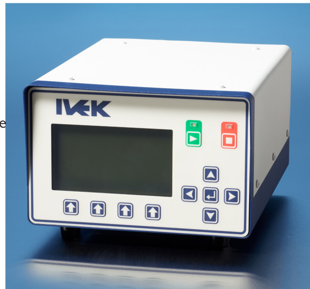
DigiSpense® 4000 bench top controller module 21cm x 29.2cm x 14.6cm