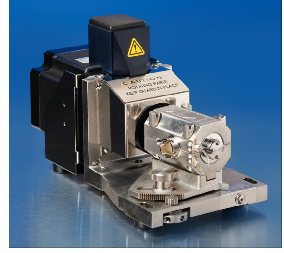
assembled split case pump module on HD motor/base 11.8cm x 19.8cm x 14.5cm