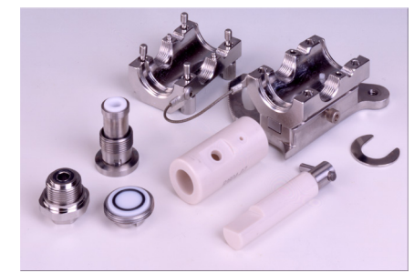
dissassembled split case

IVEK's ceramic piston/cylinder modules are extremely hard and resist abrasion, resulting in a system that exhibits little to no wear even after hundreds of millions of cycles. In addition, the ceramics are compatible with most acids and bases. The natural crystalline structure of the ceramics displays zero porosity, which insures zero retention and carry-over of one biological fluid to the next.