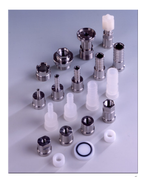
variety of inlet and outlet fittings available

IVEK's Sanitary Split Case pump module is unique among positive displacement rotary and reciprocating piston pumps. It is designed to allow the quick disassembly of all the pump module components and/or the removal and return of the entire pump module from the motor/base group without recalibration. The simple break down of all the wetted components enhances cleaning and the module can be autoclaved. An optional gauge can be used to calibrate this pump module without running fluid. This eliminates possible contamination or the loss of expensive or controlled fluid. All aspects of a 'user friendly' design and customer suggestions were considered during the pump module's development in order to allow fluid to flow freely, unobstructed through the wetted components without exposure to dead volume areas such as cracks, crevices, or threads. Constructed from cast 316 stainless steel, this heavy-duty pump module is extremely durable and stable, and will maintain calibration and accuracy during even the most difficult applications.