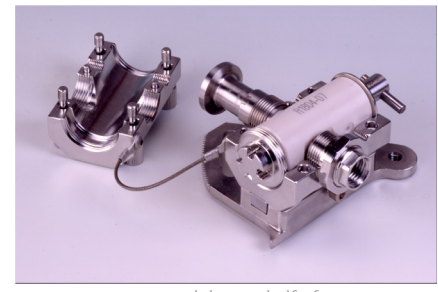
pump module, top half of case removes