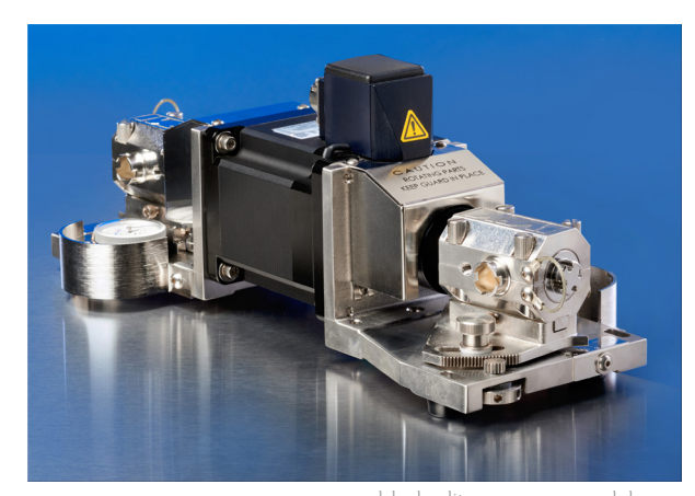
assembled split case pump module on Dual-End HD motor/base