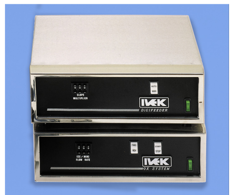
ox & digifeeder controller modules 29.8cm x 37.5cm x 14.3cm